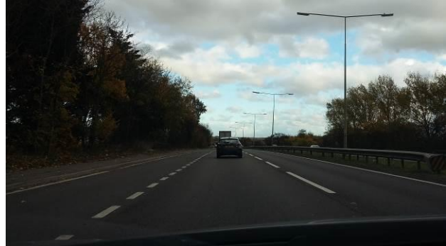
Image 4 – eastbound carriageway where road levels off and forward visibility increases, alongside acceleration lane for Little Warley Hall Lane.