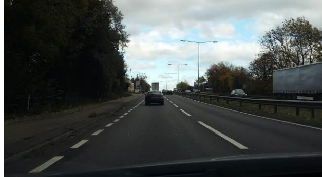
Image 2 – eastbound carriageway at end of lay-by as uphill gradient commences