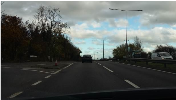
Image 3 – eastbound carriageway near crest at junction with Little Warley Hall Lane